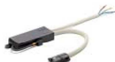
Radio receivers from page 122