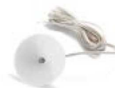
Wired sensors from page 158

Radio tubular drives RevLine M hardwired drives Venetian blind drives Speciality drives DC drive systems Radio control units Hardwired control units Accessories Door drives Door controls Door accessories Drive adapter profiles Lifting capacity tables