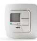
Wall mount controllers from page 140