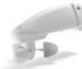
Wired sensors from page 158

Radio tubular drives RevoLine S hardwired drives Venetian blind drives Specialty drives DC drive systems Radio control units Hardwired control units Accessories Door drives Door controls Door accessories Drive adapter profiles Lifting capacity tables