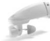
Wired sensors from page 158

Radio tubular drives RevoLine L hardwired drives Venetian blind drives Speciality drives DC drive systems Radio control units Hardwired control units Accessories Door drives Door controls Door accessories Drive adapter profiles Lifting capacity tables